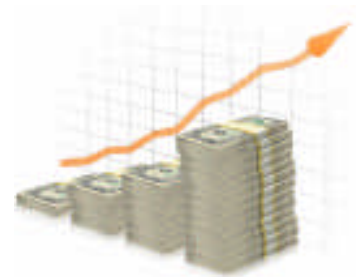
Unlock significant savings with one-time professional services

From historical audits to contract negotiations, our one-time professional services can kickoff your TEM program or be an add-on geared to identify further efficiencies after implementation. Asentinel provides the following a la carte options to accelerate optimization of their telecom programs: benchmarking, contract negotiation, historical audit, inventory build / validation, network optimization, service optimization and staff augmentation.